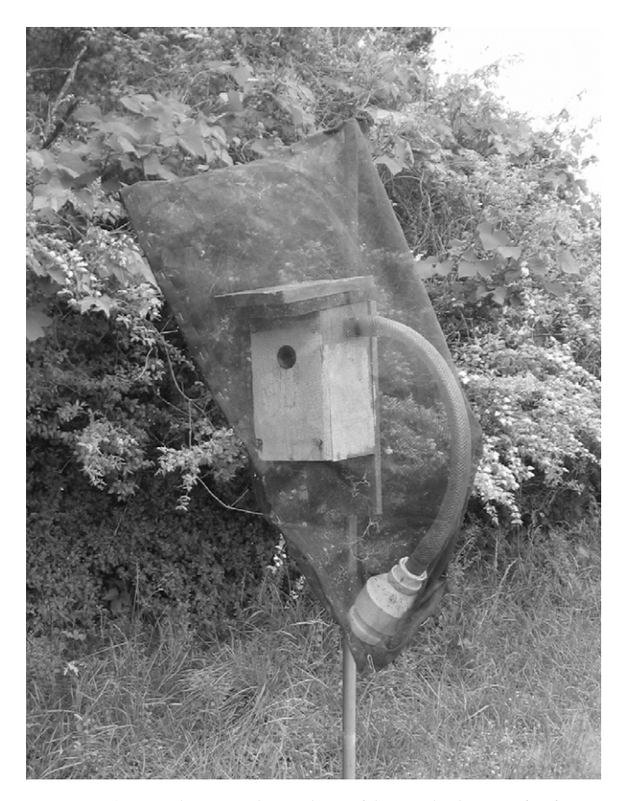
FIGURE 1. Mesh-covered nest box with attached mosquito introduction tube. Mosquitoes were introduced via the 0.75 meter tube connected to a pre-drilled hole in the nest box and a container holding approximately 30 laboratory-reared, virus-free Culex quinquefas ciatus mosquitoes.

mosquitoes without disturbing the adult female in the box. Thirty unsexed mosquitoes between 2 and 7 days post-emergence were introduced into each box. Because many mosquito species are known to mate in the presence of their hosts<sup>13</sup> and male mosquitoes often hover near host animals,<sup>14</sup> we introduced males so that mates were available to unmated females in the nest boxes. One hour before dawn, mosquitoes were collected from the boxes using a modified hand-held vacuum. Female bluebirds were released from their nest boxes after all visible mosquitoes in the mesh enclosure had been captured. Because the primary aim of this study was to assess the relative feeding rates of Cx. quinquefasciatus mosquitoes on nestling and adult bluebirds, data on recaptured mosquitoes that failed to obtain bloodmeals were not collected and the overall feeding success of the introduced mosquitoes was therefore not assessed.